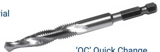
'QC' Quick Change Hex Drive Cost Cutter